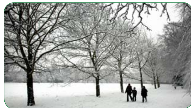
Above; © Photography by Jo Andreae, One World One Camera